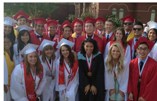
Good News!! The AVID Senior class will be able to wear their AVID sashes at graduation this year!